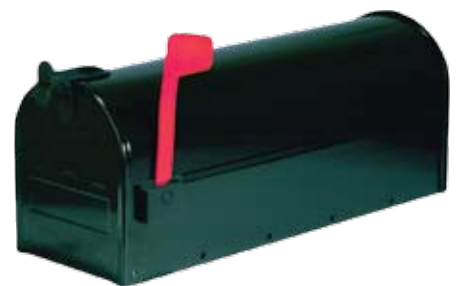
If you know the plan you want, mail-in your form today.

If you know which health plan you want, fill out the enrollment form in this packet and mail it to a Choice Counselor in the envelope provided. If you lost your envelope you can mail the form to Florida Medicaid, P.O. Box 5197, Tallahassee, FL 32314-5197.