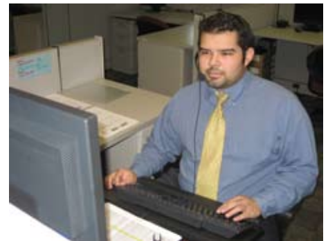
A Choice Counselor is ready to help you today.

Call Choice Counseling at 1-866-454-3959 Monday – Thursday 8:00 a.m. to 8:00 p.m. Friday 8:00 a.m. to 7:00 p.m. TDD users ONLY call 1-866-467-4970