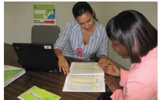
A Choice Counselor will meet you when and where you choose.

Group counseling meetings or one-on-one counseling in your area – see information in the cover letter or call Choice Counseling at 1-866-454-3959 to schedule a time to meet with a Choice Counselor. If you are disabled or are not physically able to travel, a Choice Counselor will come to you.