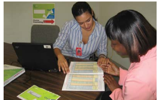
A Choice Counselor will meet you when and where you choose.

Group counseling meetings or one-on-one counseling in your area – see information in the cover letter or call Choice Counseling at 1-866-454-3959 to schedule a time to meet with a Choice Counselor. If you are disabled or are not physically able to travel, a Choice Counselor will come to you.