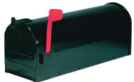
If you know the plan you want, mail-in your form today.

If you know which health plan you want, fill out the enrollment form in this packet and mail it to a Choice Counselor in the envelope provided. If you lost your envelope you can mail the form to Florida Medicaid, P.O. Box 5197, Tallahassee, FL 32314-5197.