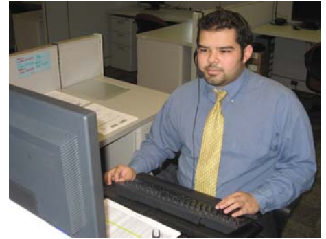
A Choice Counselor is ready to help you today.

Call Choice Counseling at 1-866-454-3959 Monday – Thursday 8:00 a.m. to 8:00 p.m. Friday 8:00 a.m. to 7:00 p.m. TDD users ONLY call 1-866-467-4970