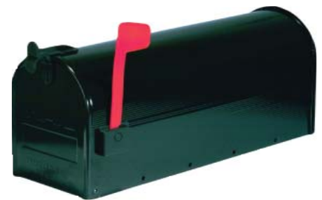
If you know the plan you want, mail-in your form today.

If you know which health plan you want, fill out the enrollment form in this packet and mail it to a Choice Counselor in the envelope provided. If you lost your envelope you can mail the form to Florida Medicaid, P.O. Box 5197, Tallahassee, FL 32314-5197.