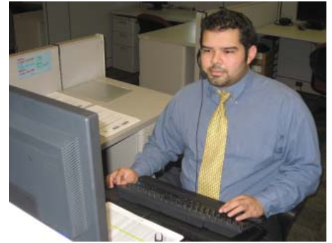
A Choice Counselor is ready to help you today.

Call Choice Counseling at 1-866-454-3959 Monday – Thursday 8:00 a.m. to 8:00 p.m. Friday 8:00 a.m. to 7:00 p.m. TDD users ONLY call 1-866-467-4970