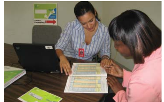
A Choice Counselor will meet you when and where you choose.

Group counseling meetings or one-on-one counseling in your area – see information in the cover letter or call Choice Counseling at 1-866-454-3959 to schedule a time to meet with a Choice Counselor. If you are disabled or are not physically able to travel, a Choice Counselor will come to you.