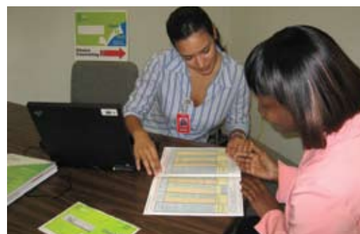
A Choice Counselor will meet you when and where you choose.

Group counseling meetings or one-on-one counseling in your area – see information in the cover letter or call Choice Counseling at 1-866-454-3959 to schedule a time to meet with a Choice Counselor. If you are disabled or are not physically able to travel, a Choice Counselor will come to you.