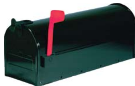
If you know the plan you want, mail-in your form today.

If you know which health plan you want, fill out the enrollment form in this packet and mail it to a Choice Counselor in the envelope provided. If you lost your envelope you can mail the form to Florida Medicaid, P.O. Box 5197, Tallahassee, FL 32314-5197.