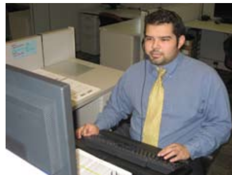
A Choice Counselor is ready to help you today.

Call Choice Counseling at 1-866-454-3959 Monday – Thursday 8:00 a.m. to 8:00 p.m. Friday 8:00 a.m. to 7:00 p.m. TDD users ONLY call 1-866-467-4970