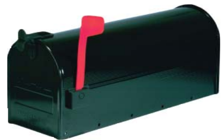
If you know the plan you want, mail-in your form today.

If you know which health plan you want, fill out the enrollment form in this packet and mail it to a Choice Counselor in the envelope provided. If you lost your envelope you can mail the form to Florida Medicaid, P.O. Box 5197, Tallahassee, FL 32314-5197.