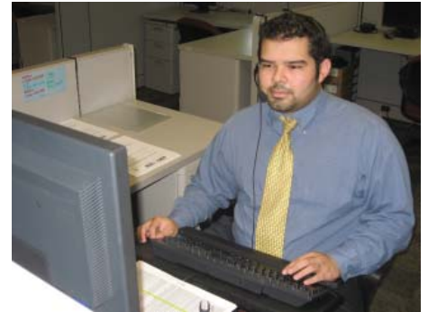
A Choice Counselor is ready to help you today.

Call Choice Counseling at 1-866-454-3959 Monday – Thursday 8:00 a.m. to 8:00 p.m. Friday 8:00 a.m. to 7:00 p.m. TDD users ONLY call 1-866-467-4970